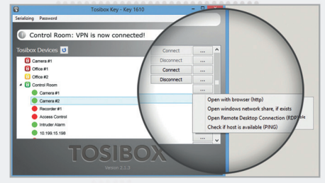
User interface TOSIBOX Key

The Key user interface shows the serialized Locks and the devices connected to them. The devices can be directly accessed (e.g. remote desktop or browser) from the Key user interface.