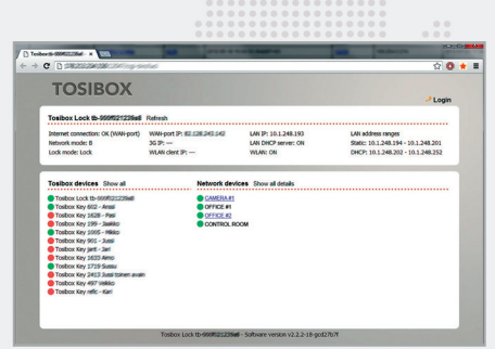
User interface TOSIBOX Lock

no software installations or network configuration.